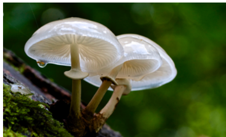
Porcelain fungus (Droppers)

The discovery of dune helleborines, a type of orchid, was unusual, a first in Warwickshire, and possibly arrived in some dumped sand. The fungi expert showed some wonderful photos to help us know our shooters from droppers!