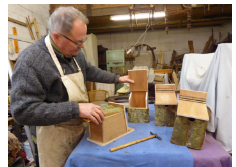
Our very own nestbox master craftsman.

PEG is very actively trying to encourage more birds to stay and raise their families in Preston and surroundings. Last year we distributed nest boxes to many of our members and look forward to hearing news of residencies being taken up – so far two boxes have had regular visits so hopefully there will be more.